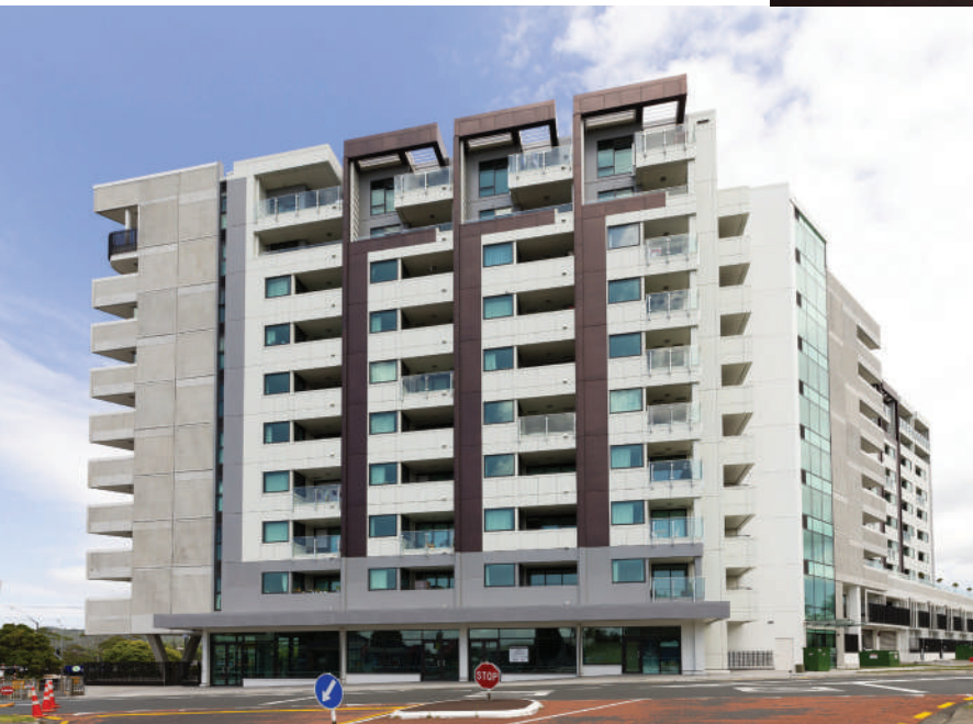
Mt Albert Apartments